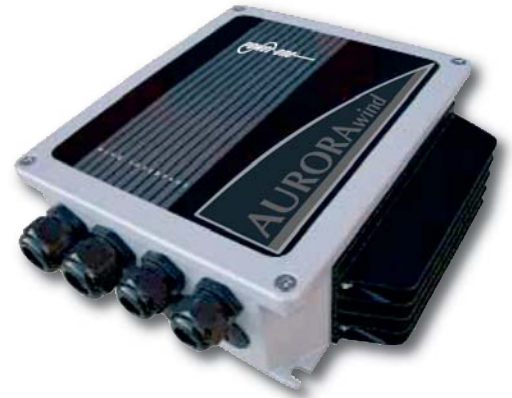
Wind Interface Box

The model PVI-Windbox is used in combination with the Aurora Wind Inverter.